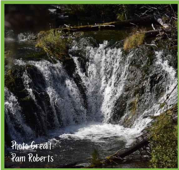
(Far Right of First Falls)

There is a small beach and shallow water that give great opportunity to cast some flies. The very brave can also wade and swim right up to the falls on hot summer days to enjoy a shower.